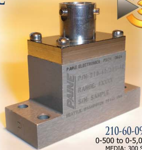
210-60-090-XX 0-500 to 0-5,000 PSID MEDIA: 300 Series CRES, 2024-T351 AL & 15-5 CRES

Electrical Connections: A= + Excitation, B= + Signal, C= - Signal, D= - Excitation.