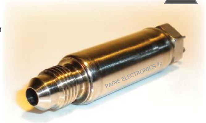
211-37-520-XX* 0-5,000 to 0-30,000 PSIA

The Inconel 718®™ material used in construction is compatible with H2S and other highly corrosive media. Instead of an O-ring, a replaceable Inconel 600 seal can be used for virtually maintenance-free, permanent installations.